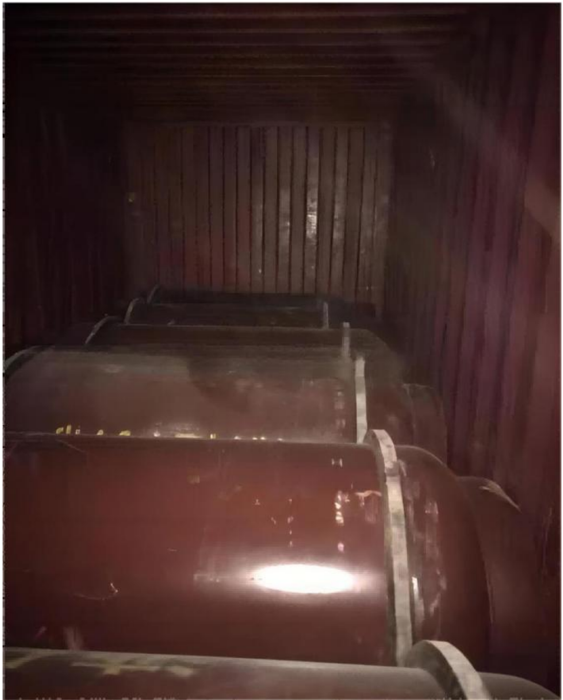
Packaging & Shipping